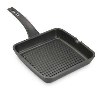
Induction PRO - Grill pan 8212 000